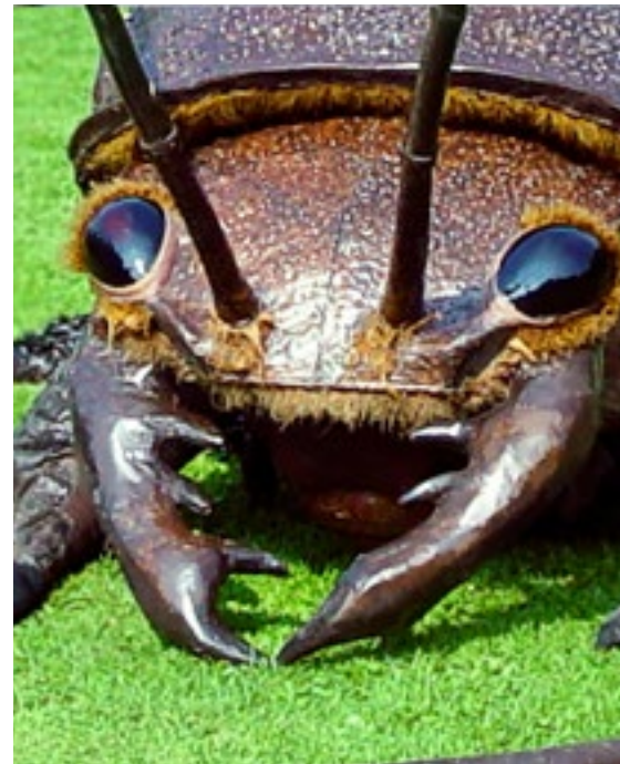
BOTTOM RIGHT Gunther the Forester