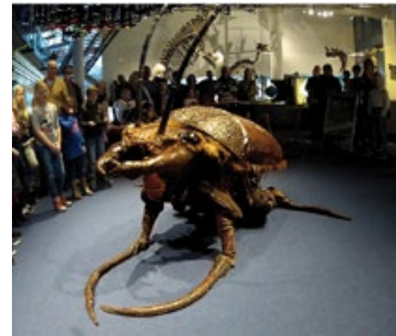
HAAGS UIT FESTIVAL DEN HAAG, Netherlands