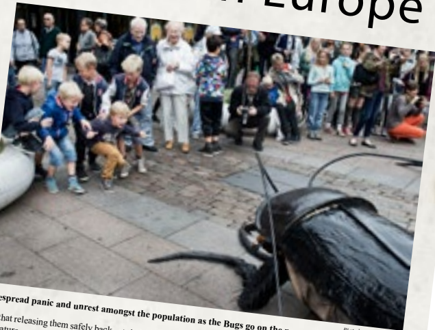
Widespread panic and unrest amongst the population as the Bugs go on the rampage