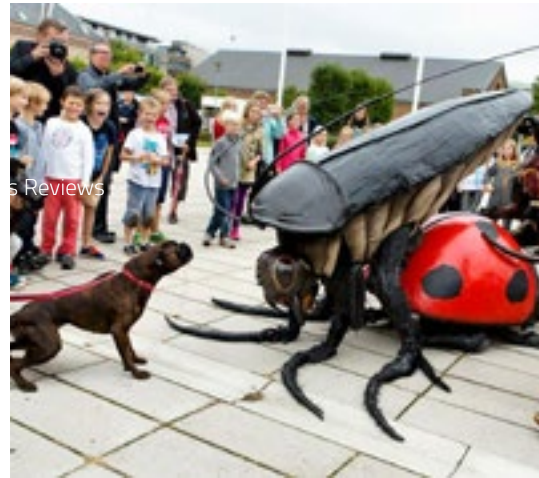
AARHUS FESTUGE AARHUS, Denmark