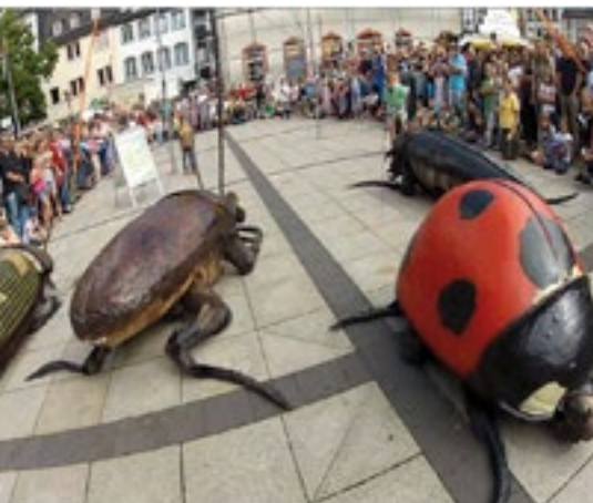
International Street Theatre Festival KOBLENZ Germany