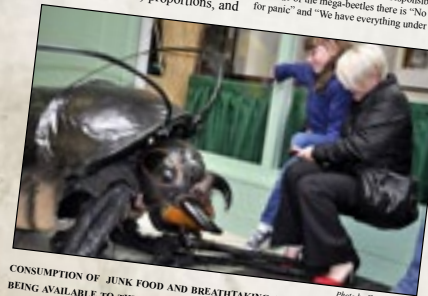
CONSUMPTION OF JUNK FOOD AND BREATHTAKING AMOUNTS OF FOOD-WASTE BEING AVAILABLE TO THESE BEETLES IN AND AROUND THE BIG CITIES IS THE CAUSE OF THEIR UNNATURAL AND PHENOMENAL GROWTH.

Concerned citizens increasingly report about the sightings of giant beetles in various cities in Europe. Widespread panic and unrest due to close encounters with these creatures are the cause of great concern amongst the population. The latest research indicates that the consumption of junk food and breathtaking amounts of food-waste being available to these beetles in and around the big cities is the cause of their unnatural and phenomenal growth. According to 'The Forester', a spokesman for the environmental organization G.R.E.E.N. which are responsible for the issue of the mega-beetles there is "No need for panic" and "We have everything under control."