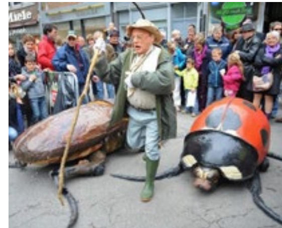
NAMUR EN MAI Festival des Arts Forains NAMUR Belgium