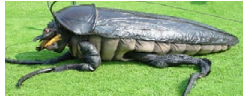
TOP Rudolf the Cockroach