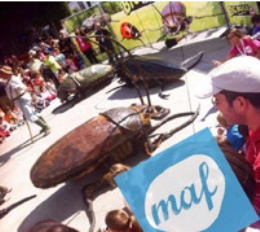
MAF Muestra Intern. de Artes Fantásticas SANTANDER Spain