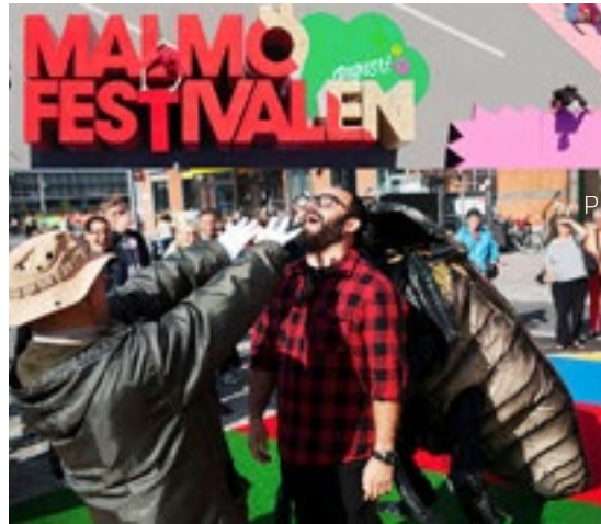
MALMÖ FESTIVALEN MALMÖ Sweden