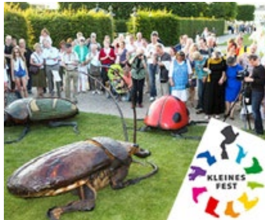
International Festival KLEINES FEST... HANNOVER Germany