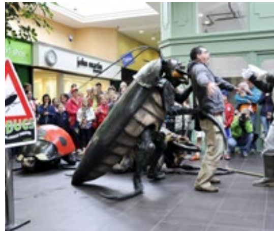
SPRAOI International Street Arts Festival WATERFORD Ireland